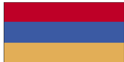
The Armenian flag

In 1995, the Constitution of Armenia was adopted through a popular referendum. It is similar to the French Constitution and calls for building an independent judiciary. A new national currency was introduced, and successful fiscal policy and newly established mechanisms of financial regulation allowed the currency to remain viable and stable. As a result, the financial system of Armenia